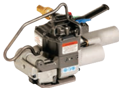
VT-16HD VT-19HD VT-25HD