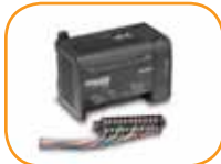
Digital pneumatics to improve throughput speed