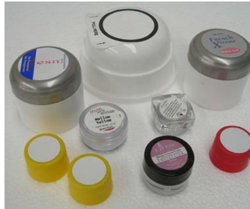
Automatically apply labels to the top & bottom of various types of products

Ketan Automated Equipment, Inc. offers a wide range of coding, labeling & product handling systems for identification of products in multiple types of industries