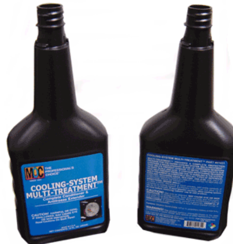
Excellent label placement accuracy

As part of the continuing process of development Ketan reserves the right to alter the specifications and other details of its products without notice. Please ask Ketan for the latest details