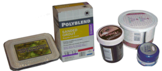
Apply labels to the tops, sides & bottoms of various types of products